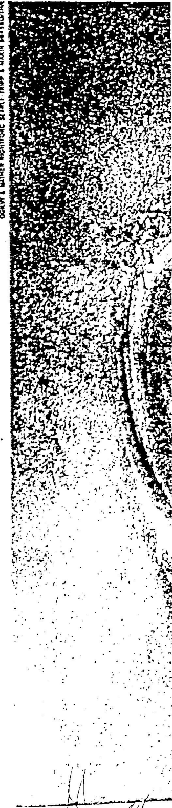
ONLY A MATTER OF TIME BEFORE SEATTLE TRUMP & MARRIAGE

The department would carry out an audit of equipment countrywide.