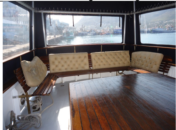
Aft deck covered in canvas and cladded ceiling. Lights added and varnished.