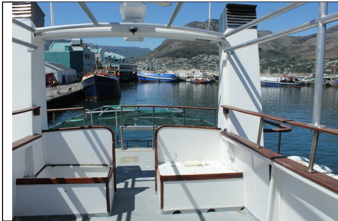
Behind the flybridge was some open seating for charter passengers.