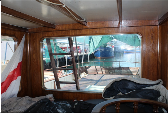
Day bed before