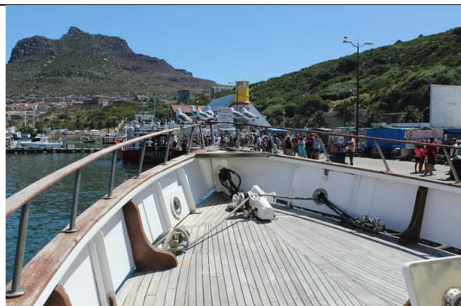
Decks were leaking all over especially the foredeck which once supported a 25 mm canon. Many deck supports were rotten and