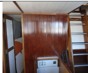
Aft wall of wheelhouse cladded and rest of wheelhouse curtained, carpeted and upholstered in leather.