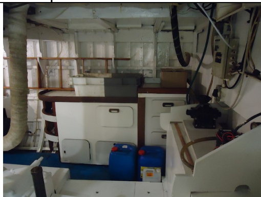
Old galley installed as tool locker and water tanks serviced.

Port side wardrobe. 24 Volt lighting added and all the wiring plumbing, hydraulics and pneumatics sorted out.