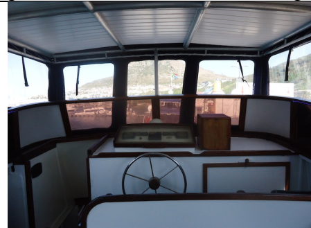
The original flybridge remained unaltered except that it is now under cover of canvas over light cladding