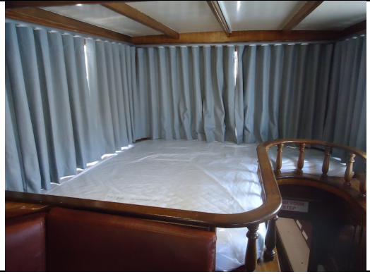
Day bed with custom made mattress, curtains and night light.