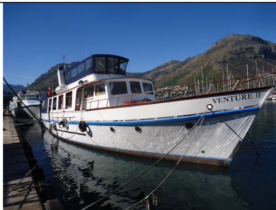
Venture II today