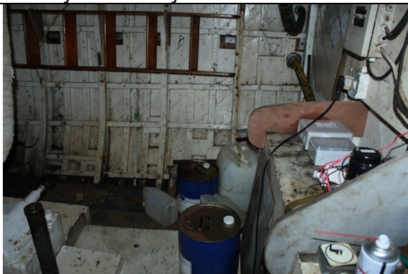
Engine room starboard side

The engine room was a bit of a mess. Extra batteries and a charger had to be added and the day tanks fully refurbished.