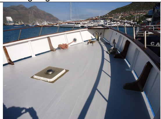
Decks were sealed with Silkaflex, impregnated with penetrating epoxy, covered in 6 oz woven fiberglass matt impregnated with standard