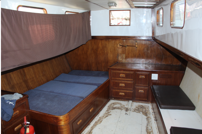
Aft Cabin before.