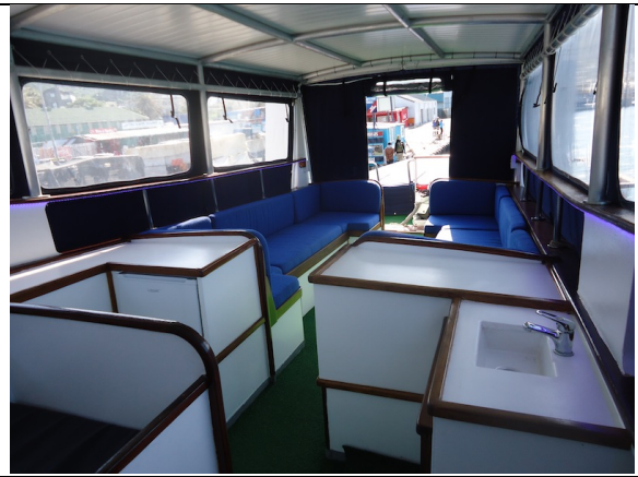
Converted to a wet bar with fridge, basin and lounge and covered with artificial grass.