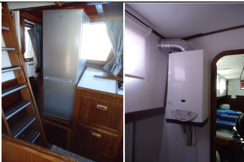
Fridge freezer installed in wheelhouse and hot water geyser added to ensuite heads in aft cabin