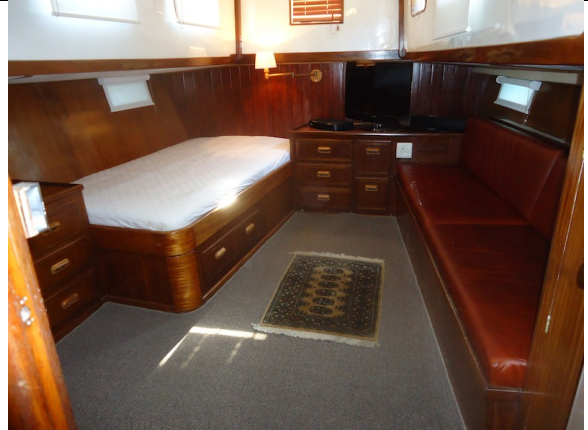
New carpet, roller shades, cladding on rear wall, leather seats, custom made mattress .TV