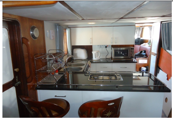
Galley with gas stove recessed in marble tops, double zink with hot water. All electrical wiring accessible behind cupboard spaces.