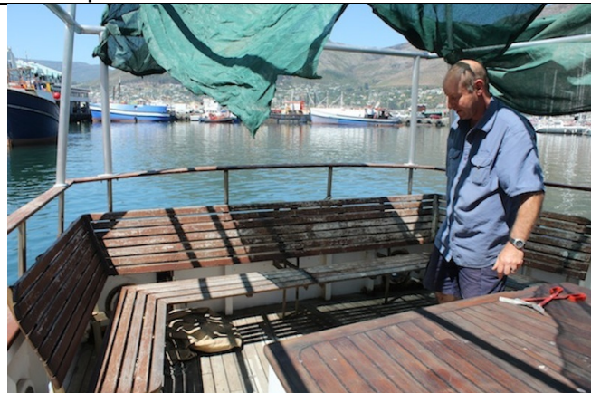
Aft deck was open before