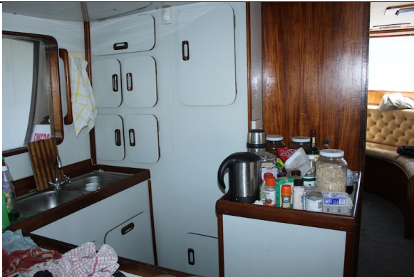
Galley before. There was no stove or hot water