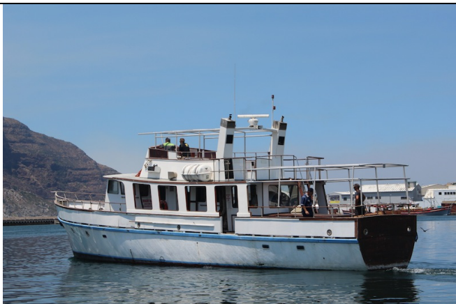
Venture II before